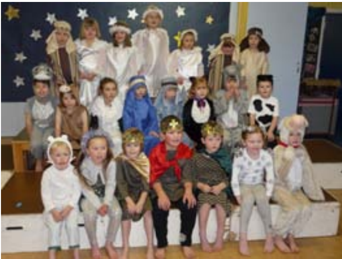
The infant production of The Landlord's Cat

The children and school staff have all worked hard to produce enjoyable entertainment – some comments to me include " Like a West End show! " and " I would have paid £5 to see that! " The children were struck down by various illnesses and I would like to praise the understudies for happily changing their roles so that the show could go on! Here they are in their stunning outfits.