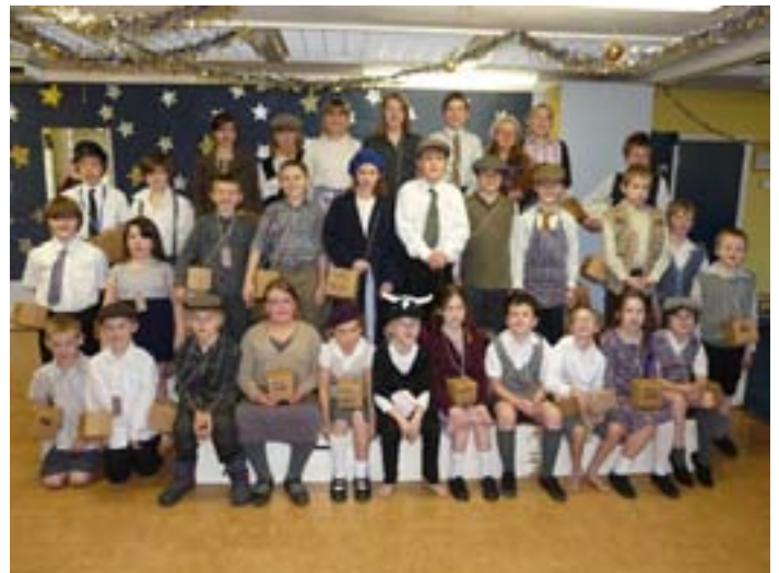
The junior production of Evacuees